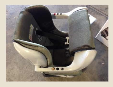
Note the wooden peg holding the

goes to Brian Lyons and the CPS Team in Pueblo for submitting the 'best' misuse photo for November 2013.