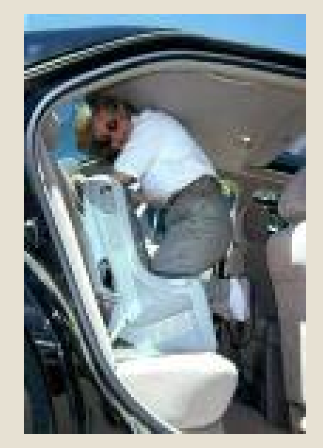
Still Doing This?

Safe Kids and State Farm present: Child Restraint Manufacturer Update: Summer Infant Dec. 12, 2013 from 2 pm – 3 pm ET (East Coast/NY time) CPS CEUs available: 1 (CHES/MCHES credit is also