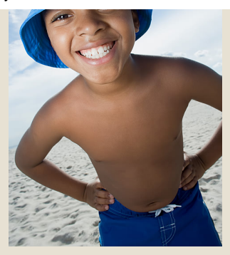
Thank you for all you do to keep kids safe!.