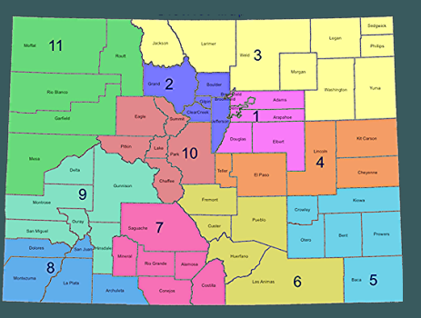
CPS Team Co Advisory Council District Map